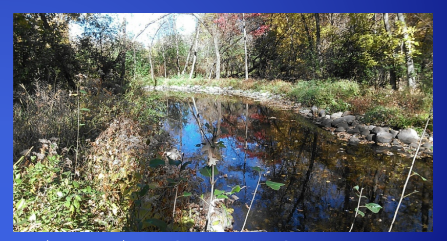
Main Stem Restoration Project (CR2011): Before and After