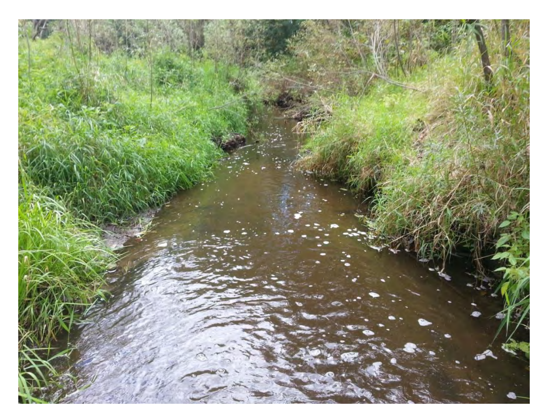
Photo 10. Site 11. Minor to moderate erosion on outside of bank meander