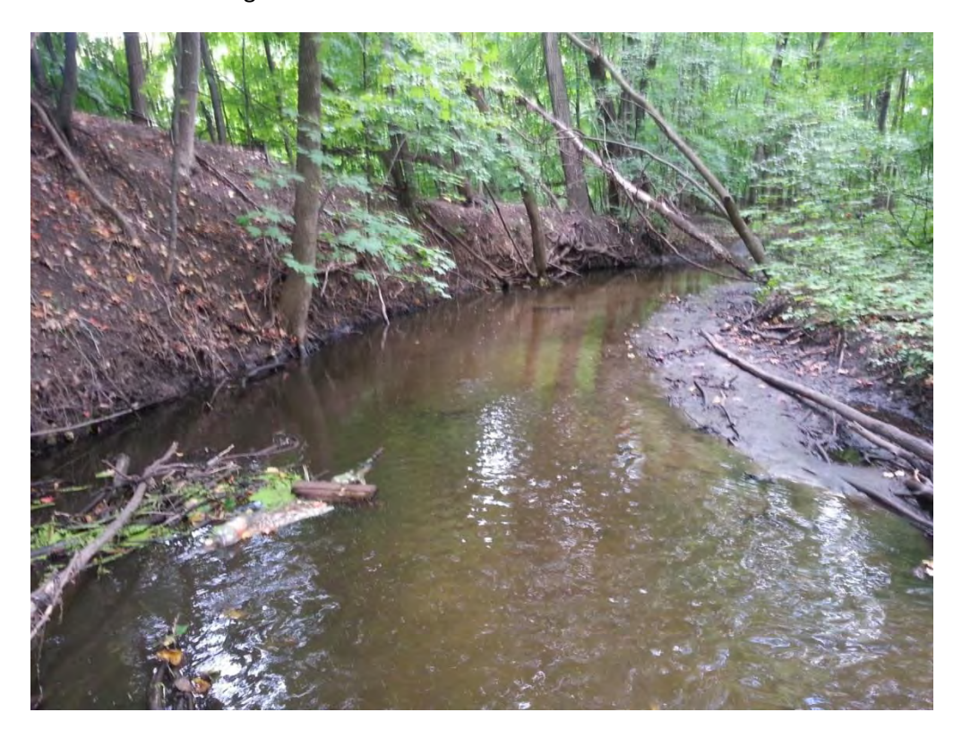
Photo 16. Site 17. Minor to moderate erosion on outside of stream bend