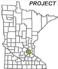
Hennepin County State of Minnesota

SOURCE: MN DNR, USDA, ESRI, TIGER, Bing, Hennepin Co., Anderson Engineering