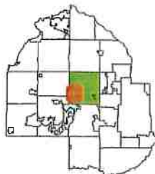
City of Plymouth Hennepin County, MN