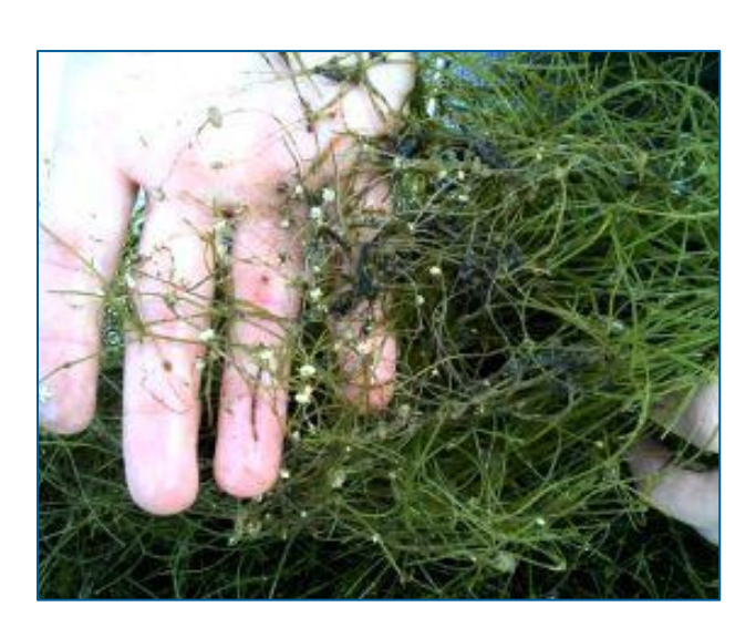
Starry stonewort, pictured above, is an invasive green alga. Star-shaped structures called "bulbils" allow it to reproduce vegetatively.

Starry stonewort is dioecious, meaning that individuals are either male or female – unlike many plants and algae that have both male and female reproductive parts. The best evidence to date indicates that the populations in the United States are all male, although there may be undiscovered females. This means that starry stonewort reproduction in the United States is vegetative and the spread of starry stonewort is probably through human movement of fragments from lake to lake. In