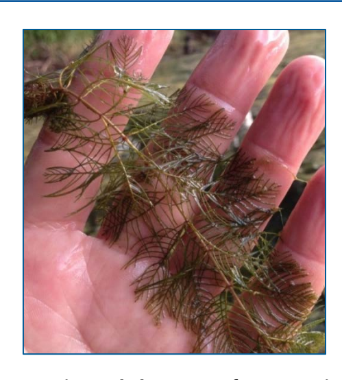
EWM, pictured above, autofragments in the summer; small branches that break off the plant and form roots establish new plants.

Eurasian watermilfoil (EWM) reproduces from fragments and seeds. Although reproduction from seeds was thought to be uncommon, the presence of hybrids and viable seeds suggests that sexual reproduction can be important. Plants flower once they grow to the surface in June through September. The plant will also produce autofragments in the summer; small branches that break off the plant and form roots which can establish new plants. Any fragment of the plant stem that includes a node (whorl of leaves) can produce a new viable plant. Eurasian watermilfoil stores carbohydrates in the lower stems and root crowns which enables the plant to survive over the winter, even with low or no light under the ice. In