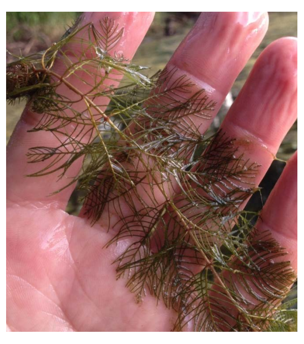
Prepared for: Bassett Creek Watershed Management Commission