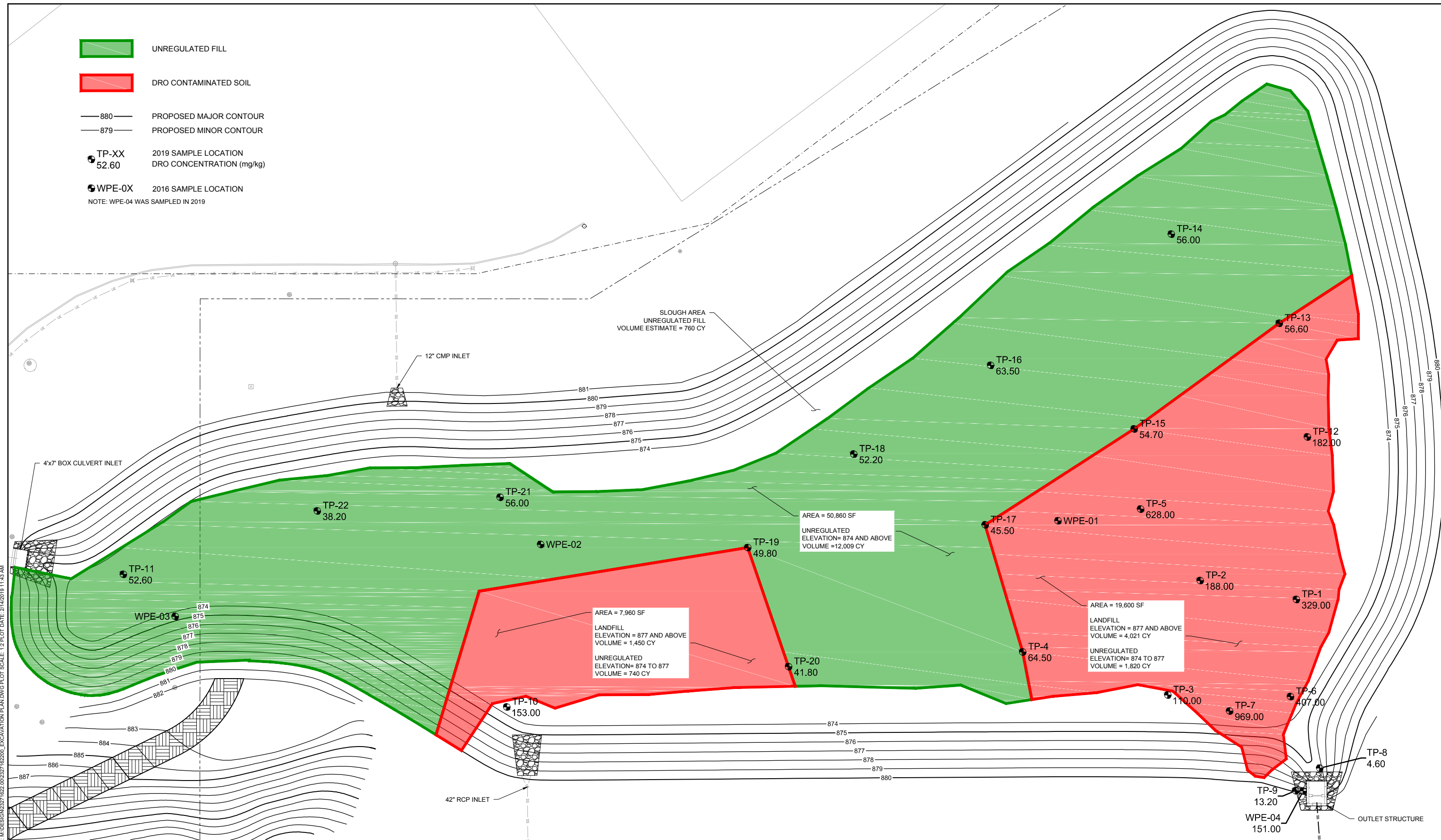
1 PLAN: EXCAVATION PLAN 0 20 40 SCALE IN FEET