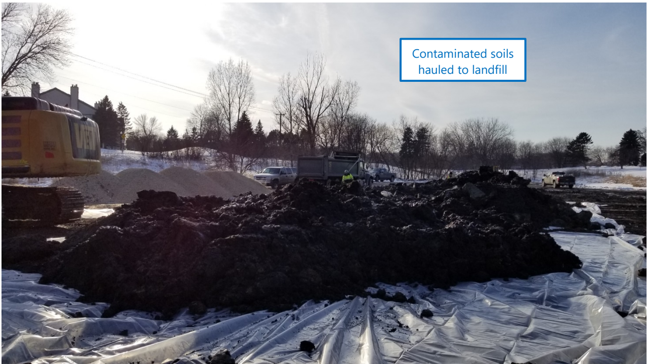
Contaminated soils hauled to landfill