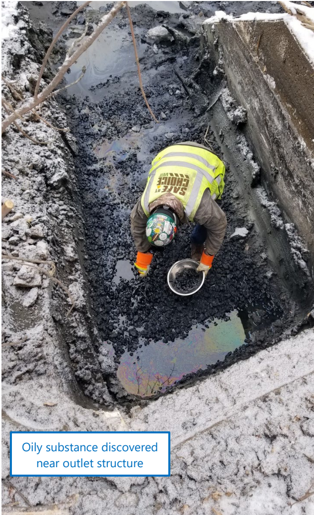
Oily substance discovered near outlet structure