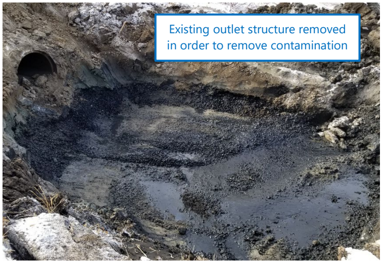
Existing outlet structure removed in order to remove contamination