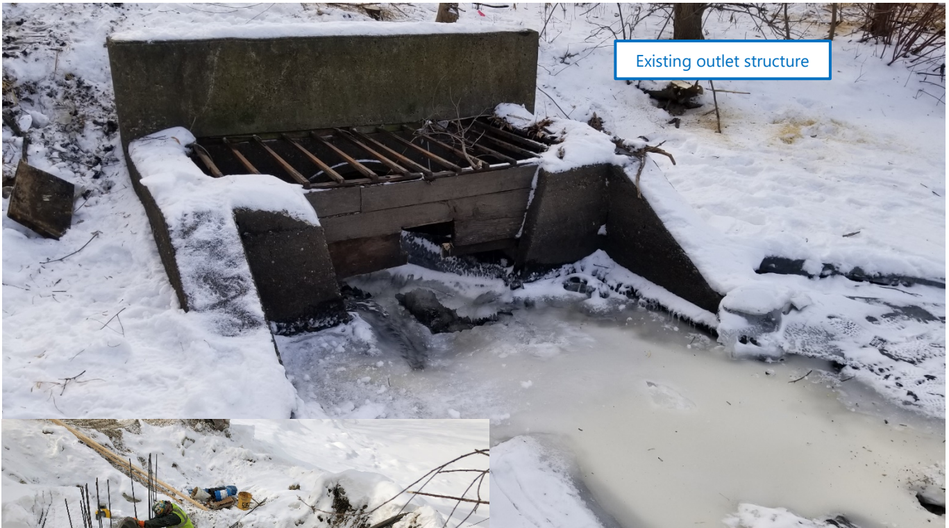
Existing outlet structure