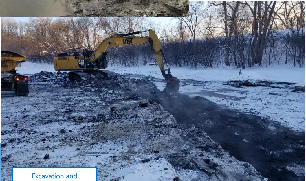
Excavation and removal of pond muck