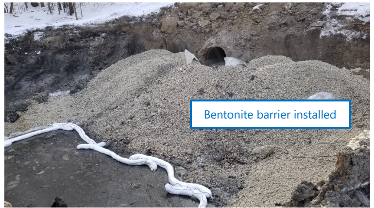
Bentonite barrier installed