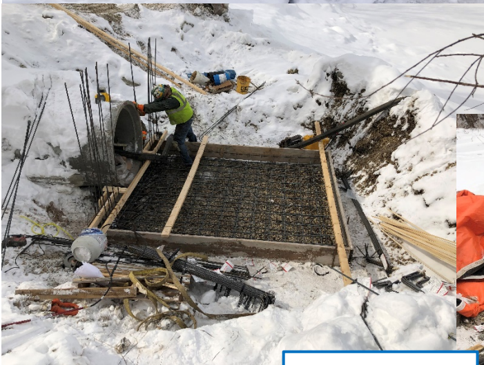
Forming and pouring new outlet structure