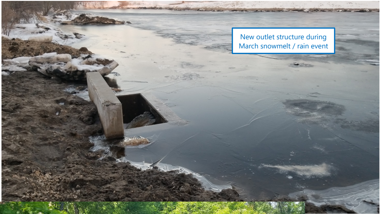
New outlet structure during March snowmelt / rain event