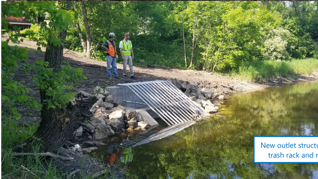
New outlet structure with trash rack and riprap