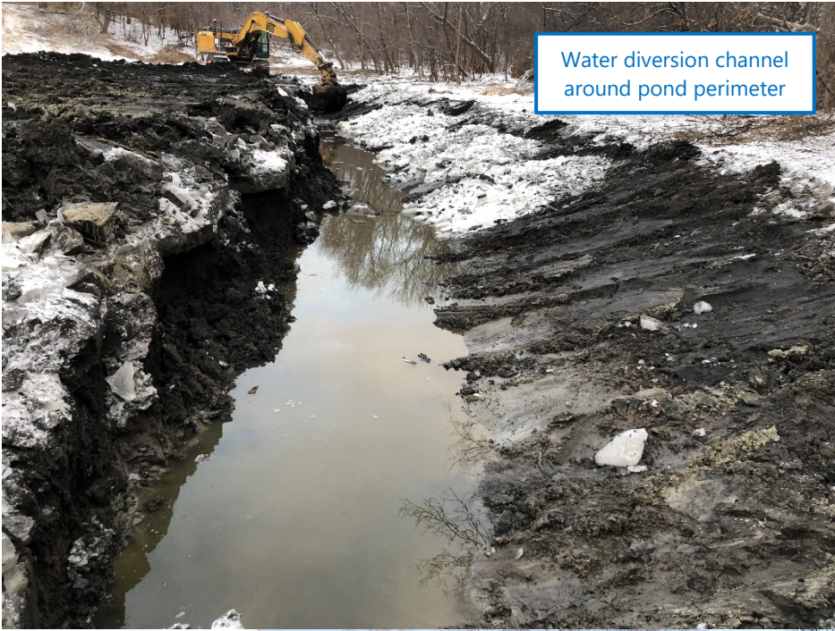
Water diversion channel around pond perimeter