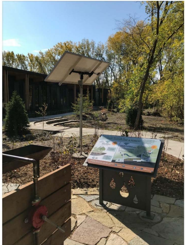
Pump patio educational sign at Westwood Hills Nature Center