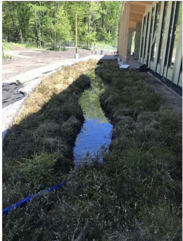
Transplanted bog fully planted