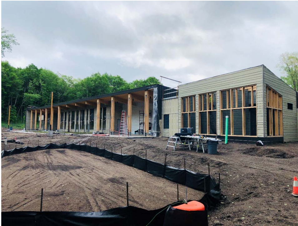
North water feature under construction