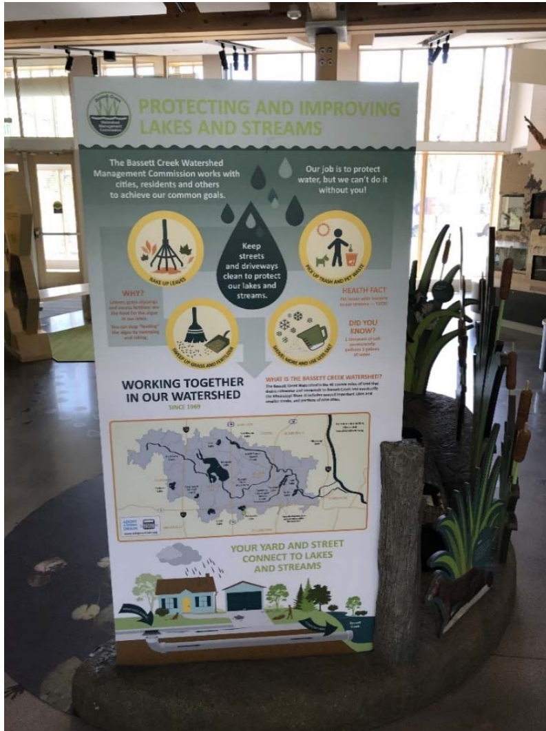
Watershed educational sign located inside the interpretive center of Westwood Hills Nature Center