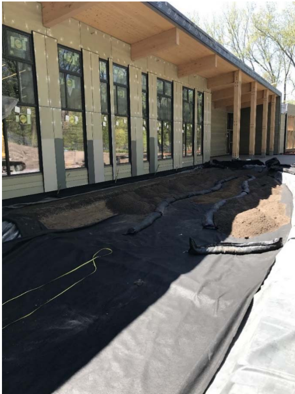
Bog liner and maintenance channel installation