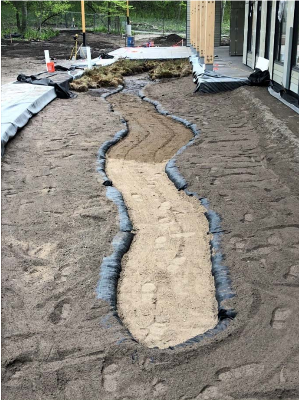
Tamarack bog at the start of planting