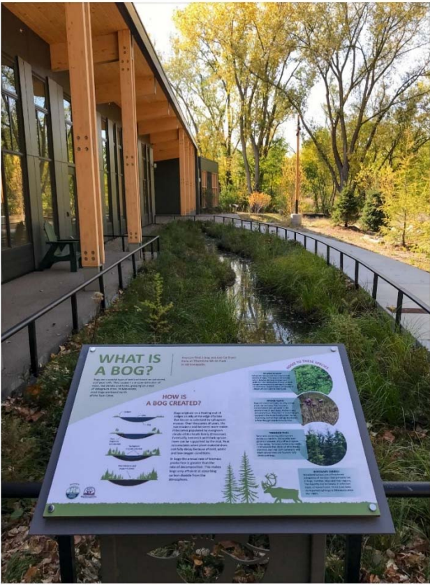
Bog educational sign facing bog at Westwood Hills Nature Center