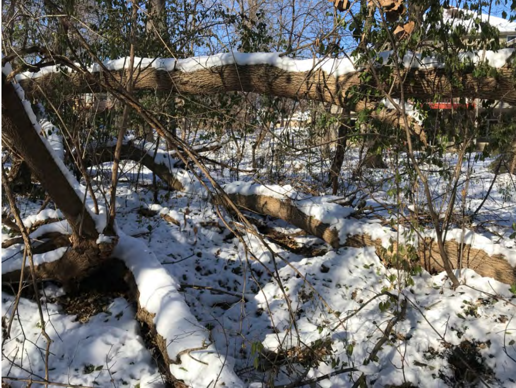
Figure A- 9 In-channel debris leading to bank erosion and sediment aggradation.