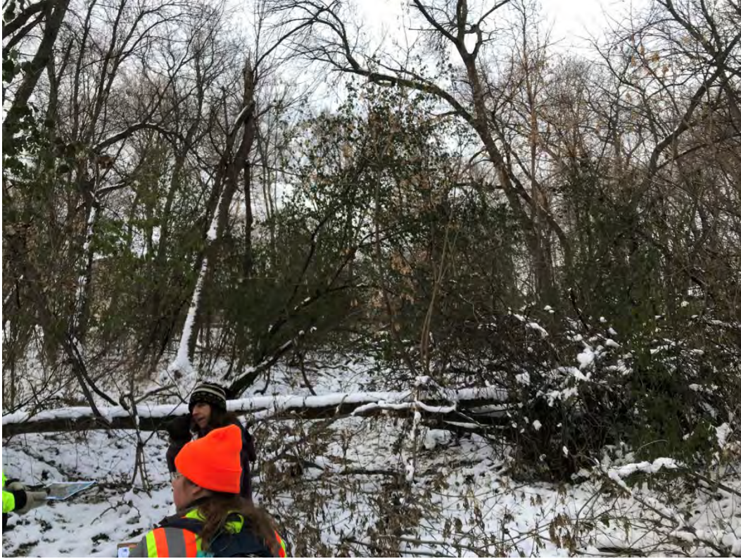
Figure A- 11 In-channel debris leading to bank erosion and sediment aggradation.