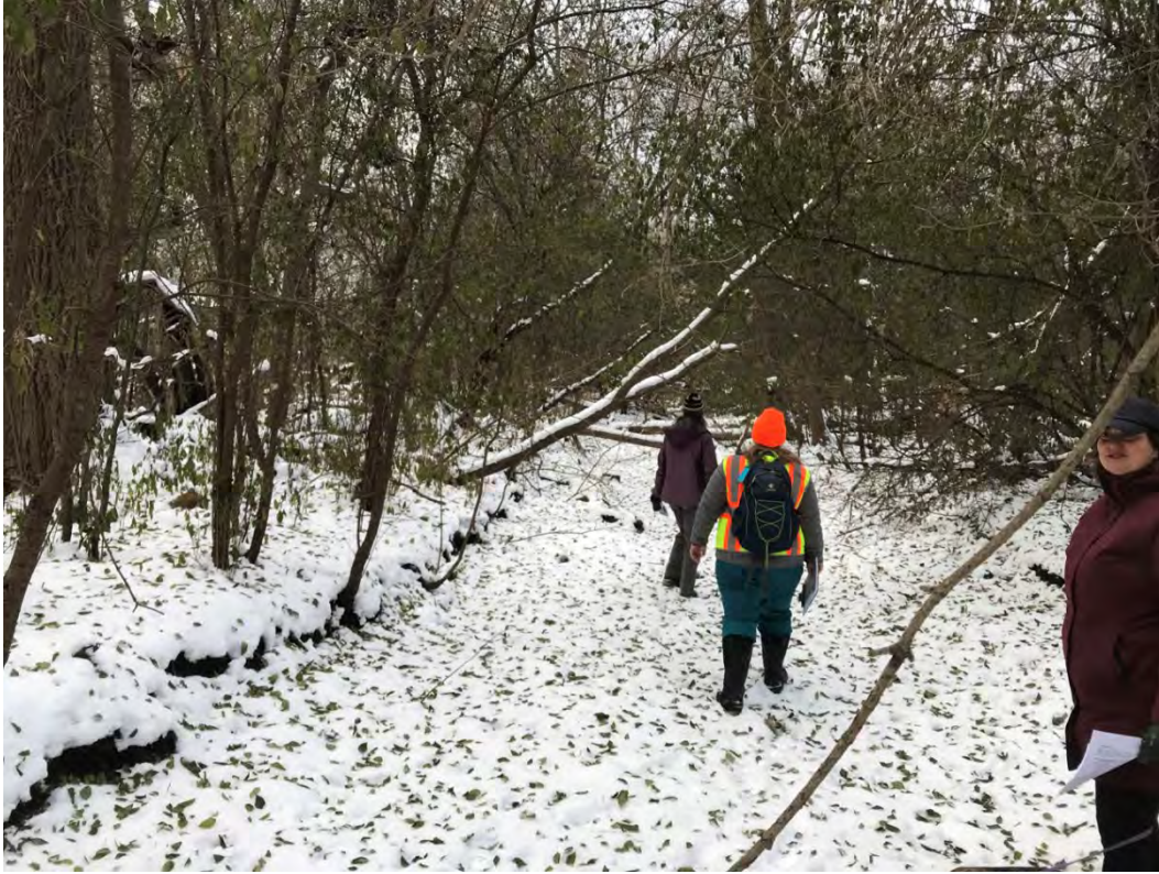
Figure A- 23 In-channel debris leading to bank erosion and sediment aggradation.