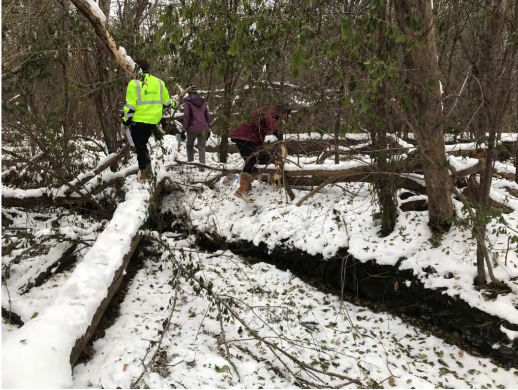
Figure A- 27 In-channel debris leading to bank erosion (close up of bank at same location as above figure).