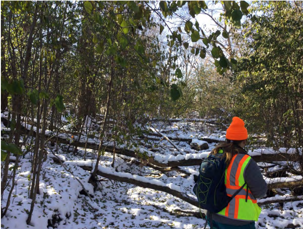
Figure A- 18 In-channel debris leading to bank erosion and sediment aggradation.