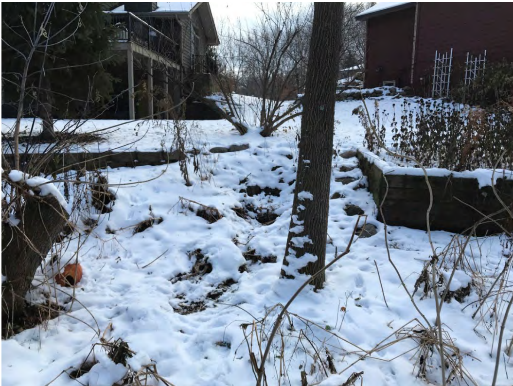
Figure A- 16 Upstream end of southeast stormwater side-channel.