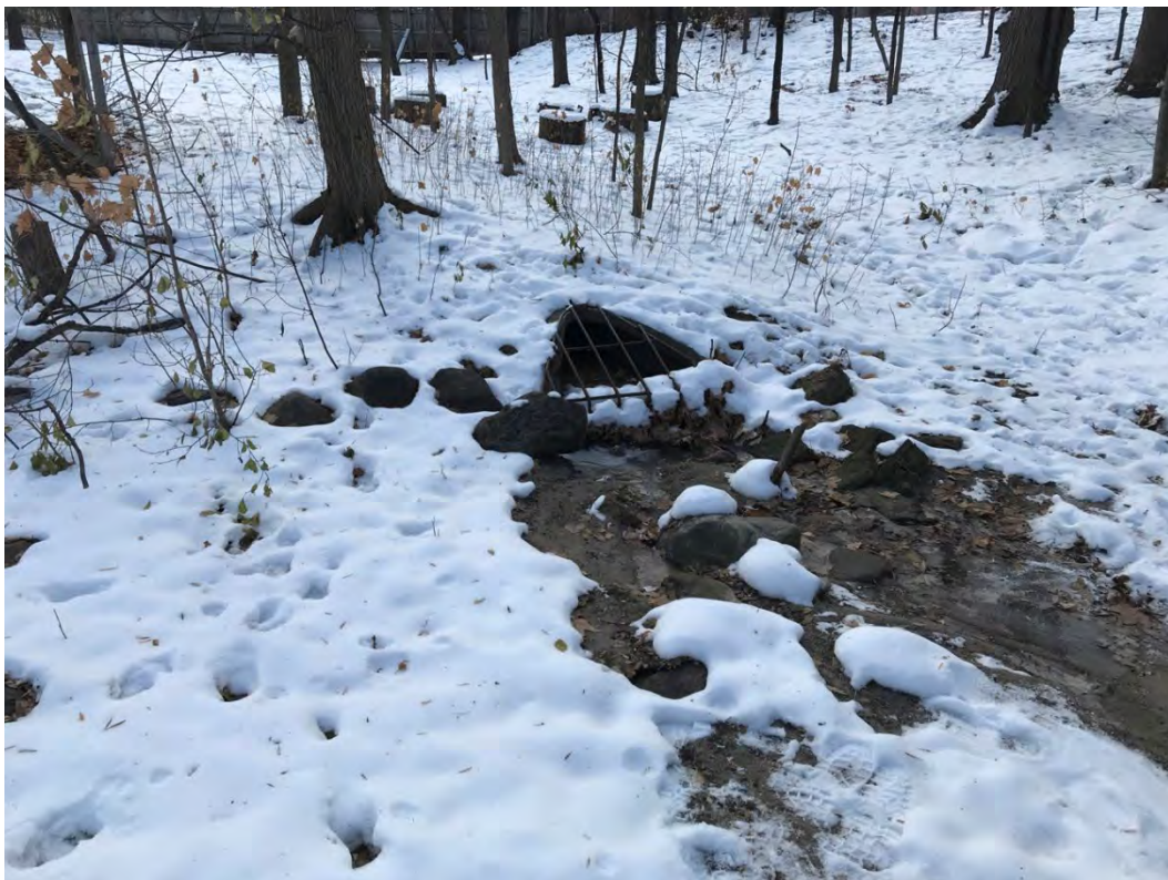
Figure A- 14 Upstream end of southwest stormwater side-channel.