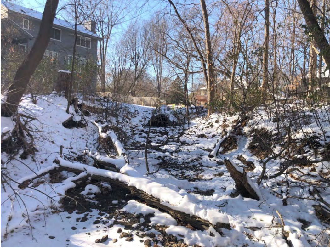
Figure A- 1 Upstream end of reach with in-channel debris and bank erosion.