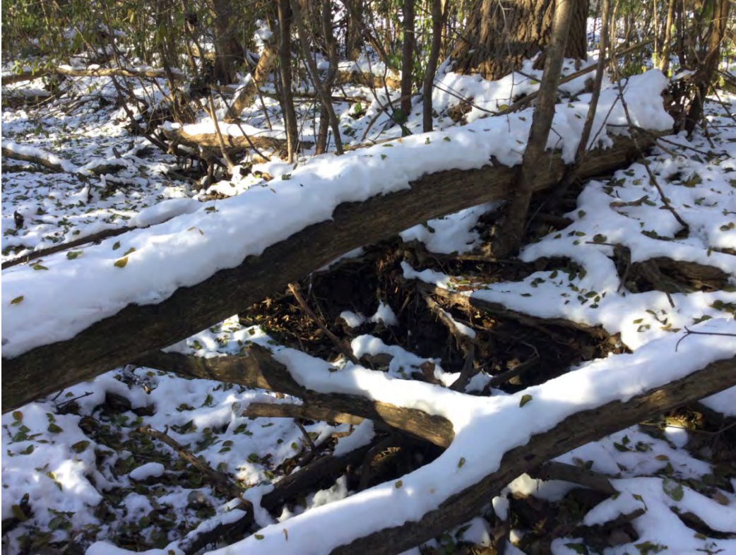
Figure A- 17 Left bank undercutting with in-channel debris.