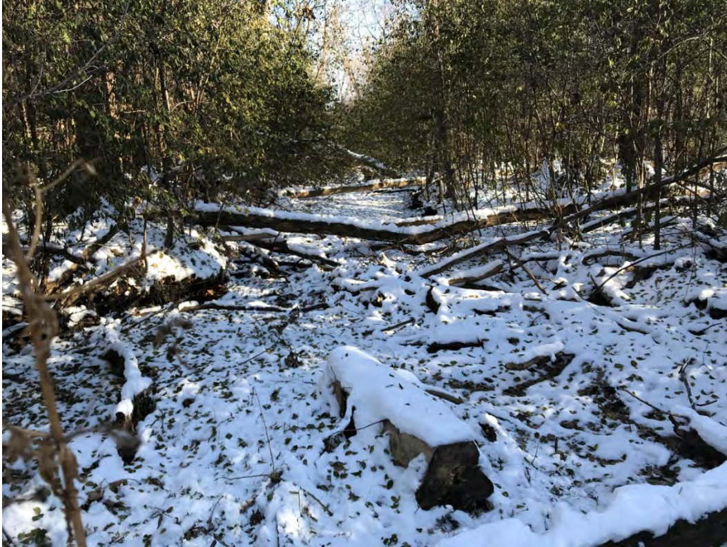
Figure A- 13 In-channel (same location but different angle as figure above).