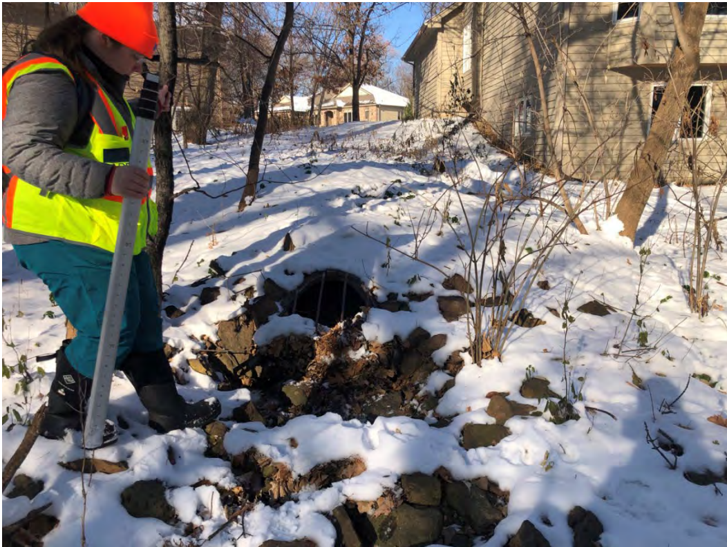
Figure A- 6 Upstream end of north stormwater side-channel.