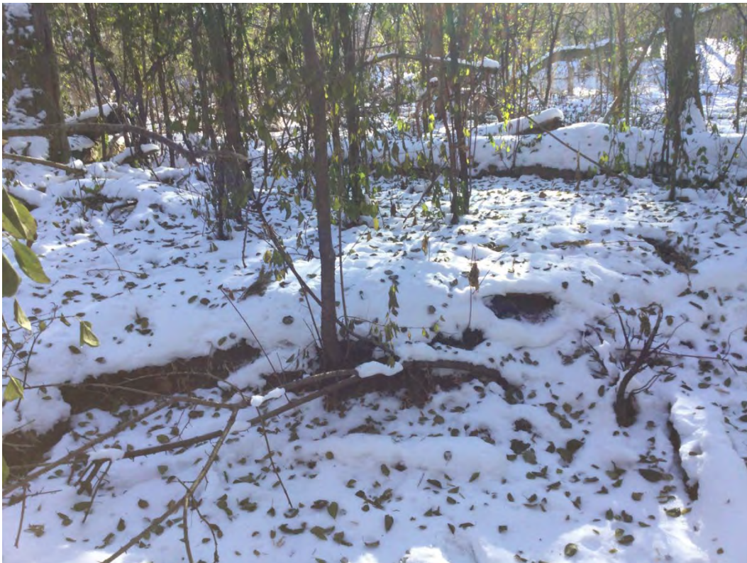
Figure A- 20 Right bank erosion.