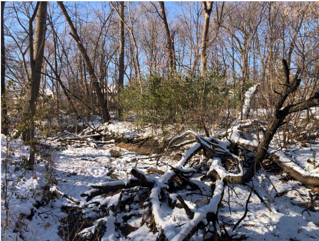
Figure A- 8 In-channel debris leading to bank erosion and sediment aggradation.