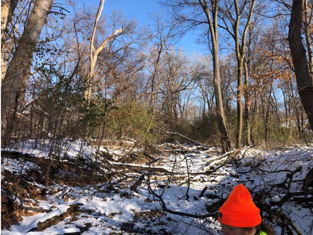
Figure A- 7 In-channel debris leading to bank erosion and sediment aggradation.