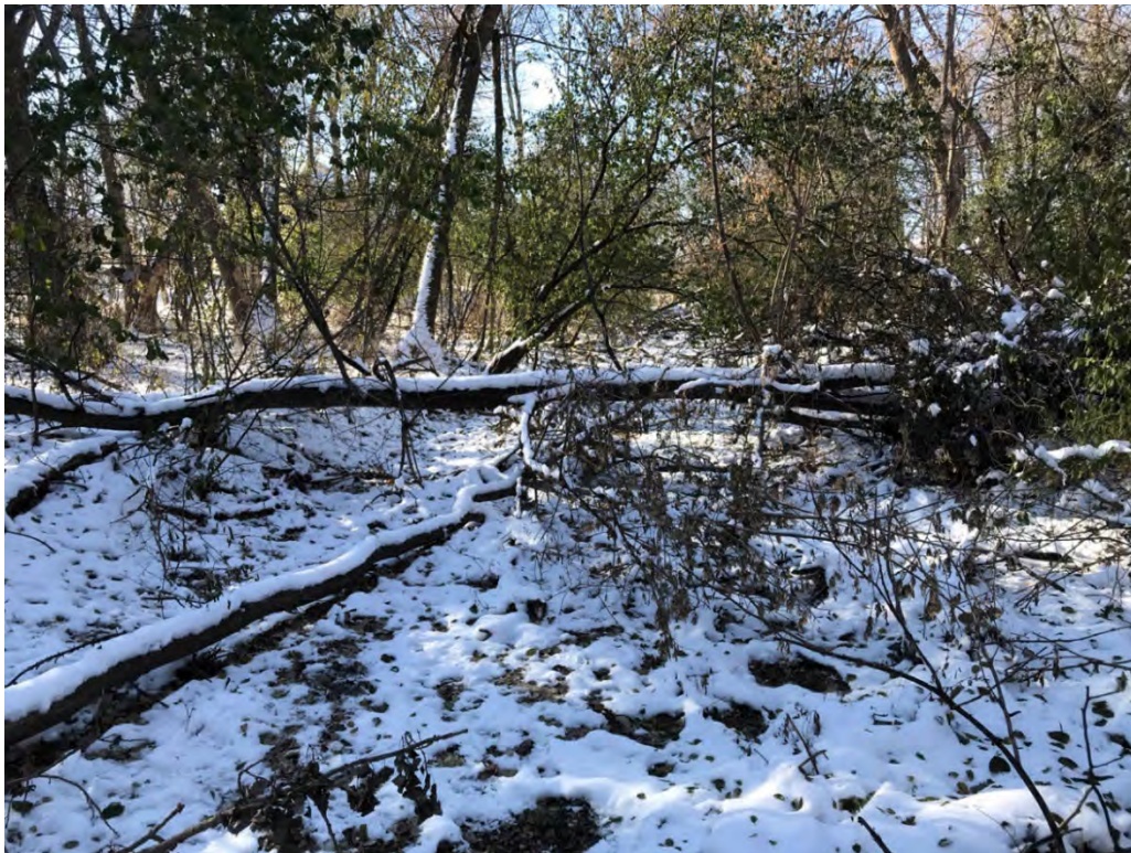
Figure A- 12 In-channel debris leading to bank erosion and sediment aggradation.