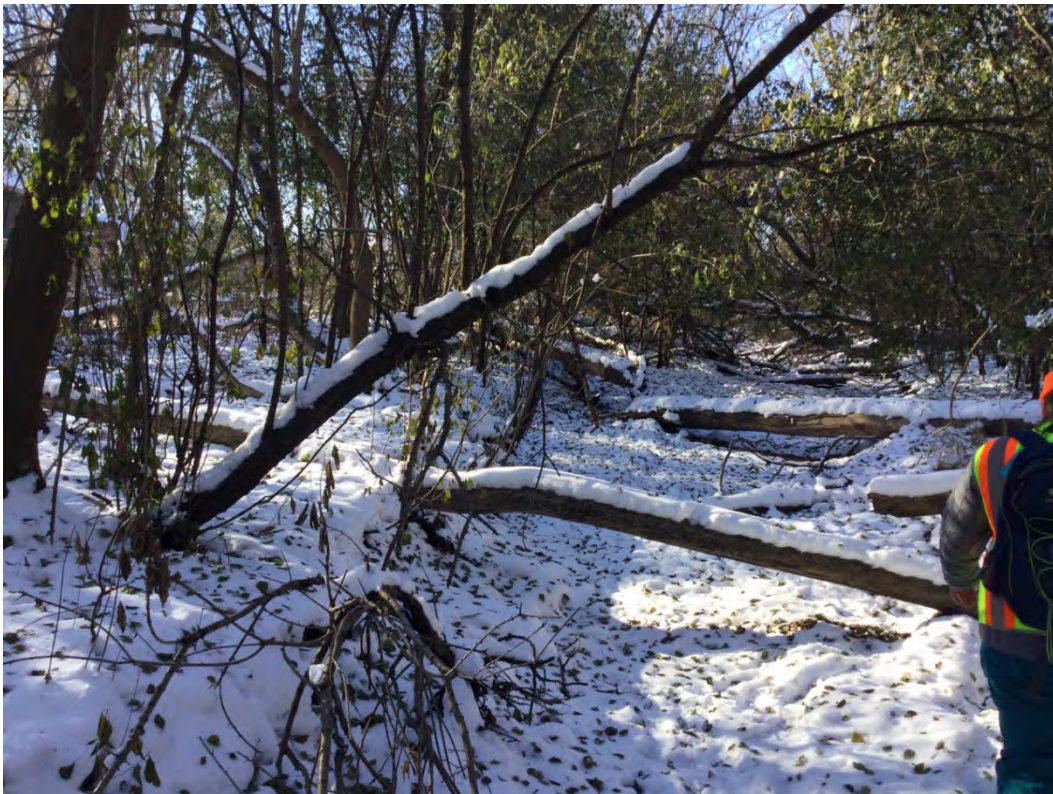
Figure A- 22 In-channel debris leading to bank erosion and sediment aggradation.