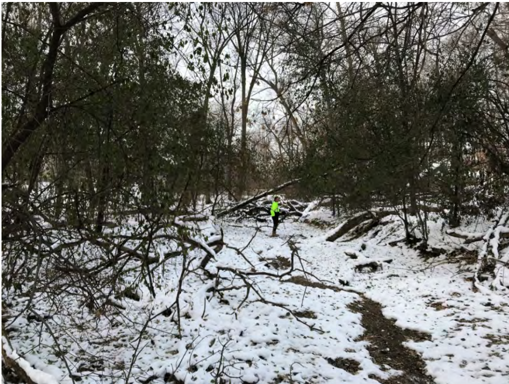
Figure A- 10 In-channel debris leading to bank erosion and sediment aggradation.