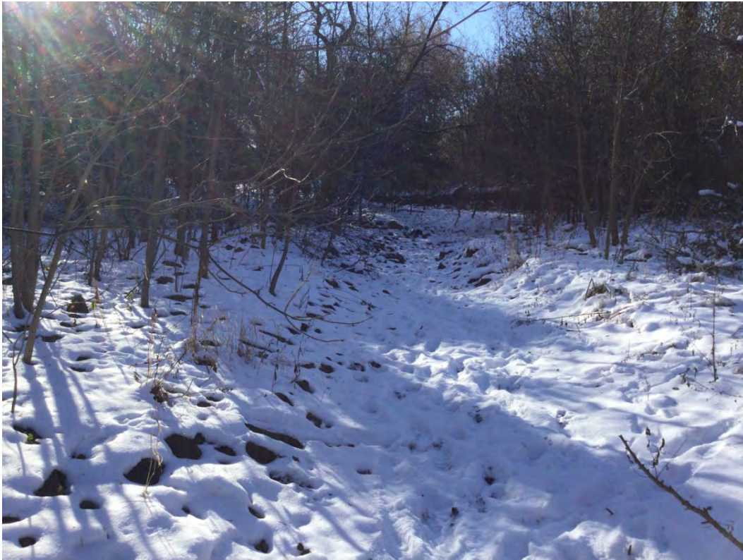
Figure A- 28 Downstream end of reach (looking upstream)