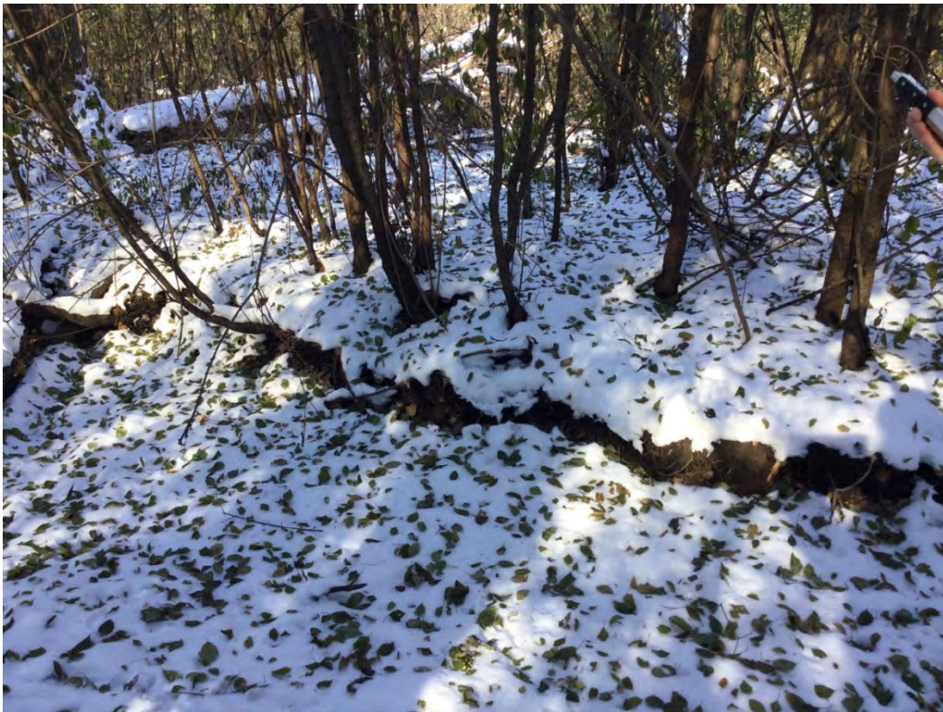
Figure A- 24 Left bank erosion with undercutting.