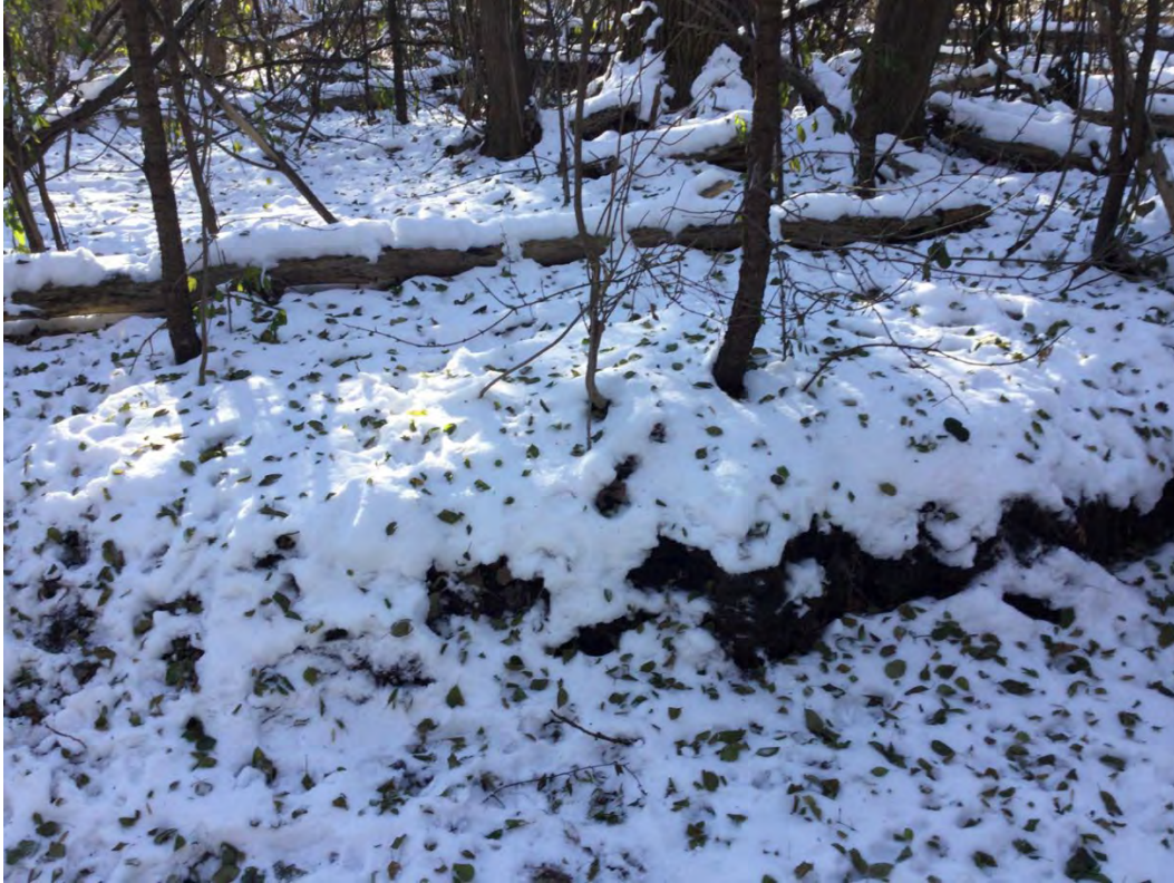
Figure A- 25 Right bank erosion with undercutting.