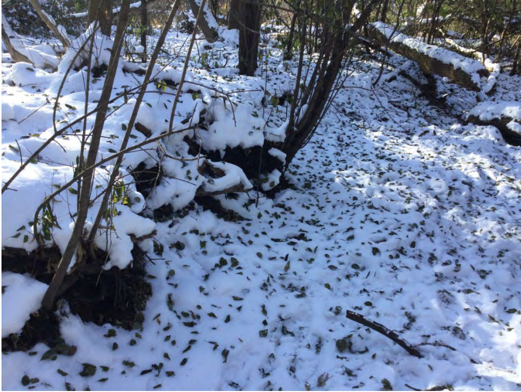
Figure A- 19 Right bank erosion.