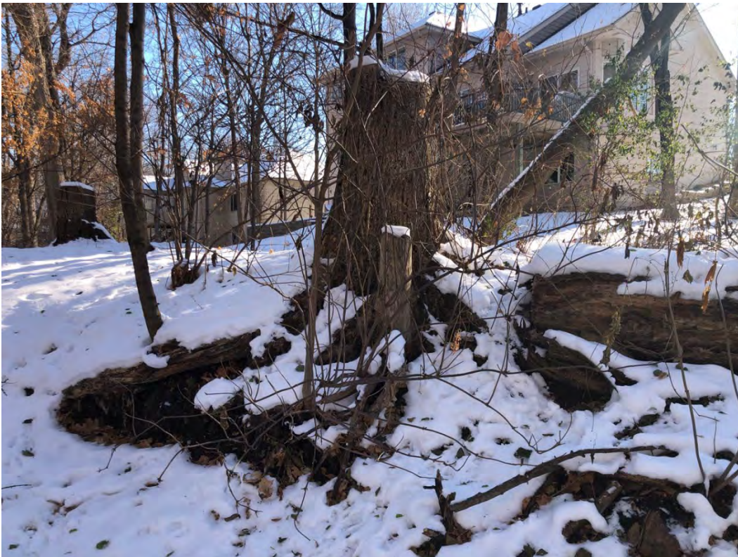
Figure A- 2 Right bank erosion.