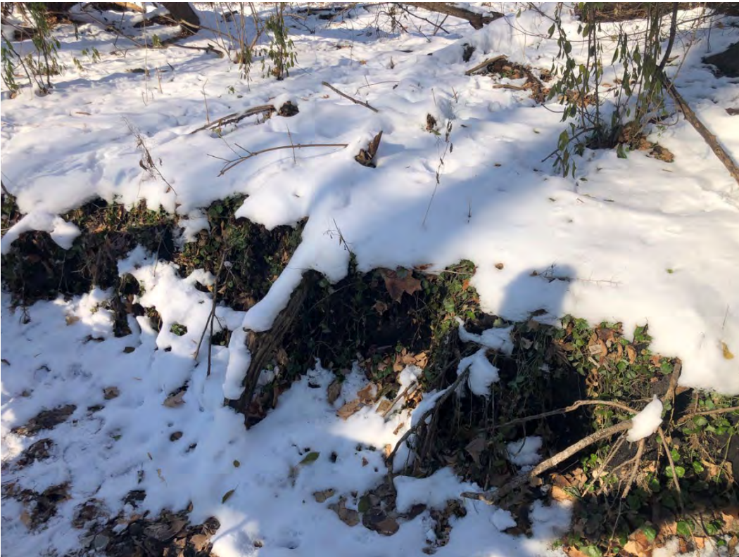
Figure A- 4 Bank erosion with undercutting.