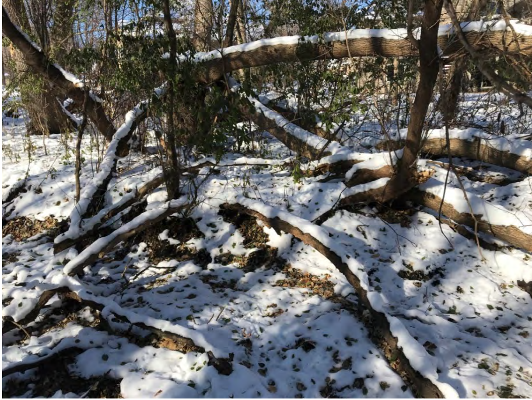
Figure A- 5 Bank erosion and in-channel debris.