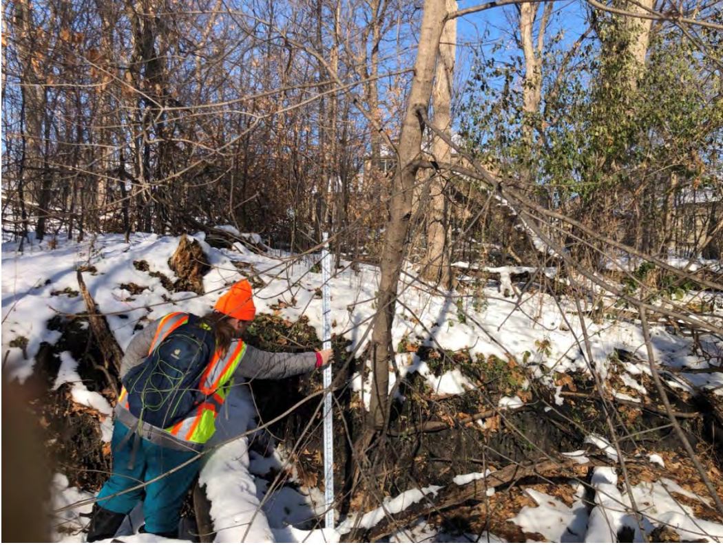
Figure A- 3 Left bank erosion.