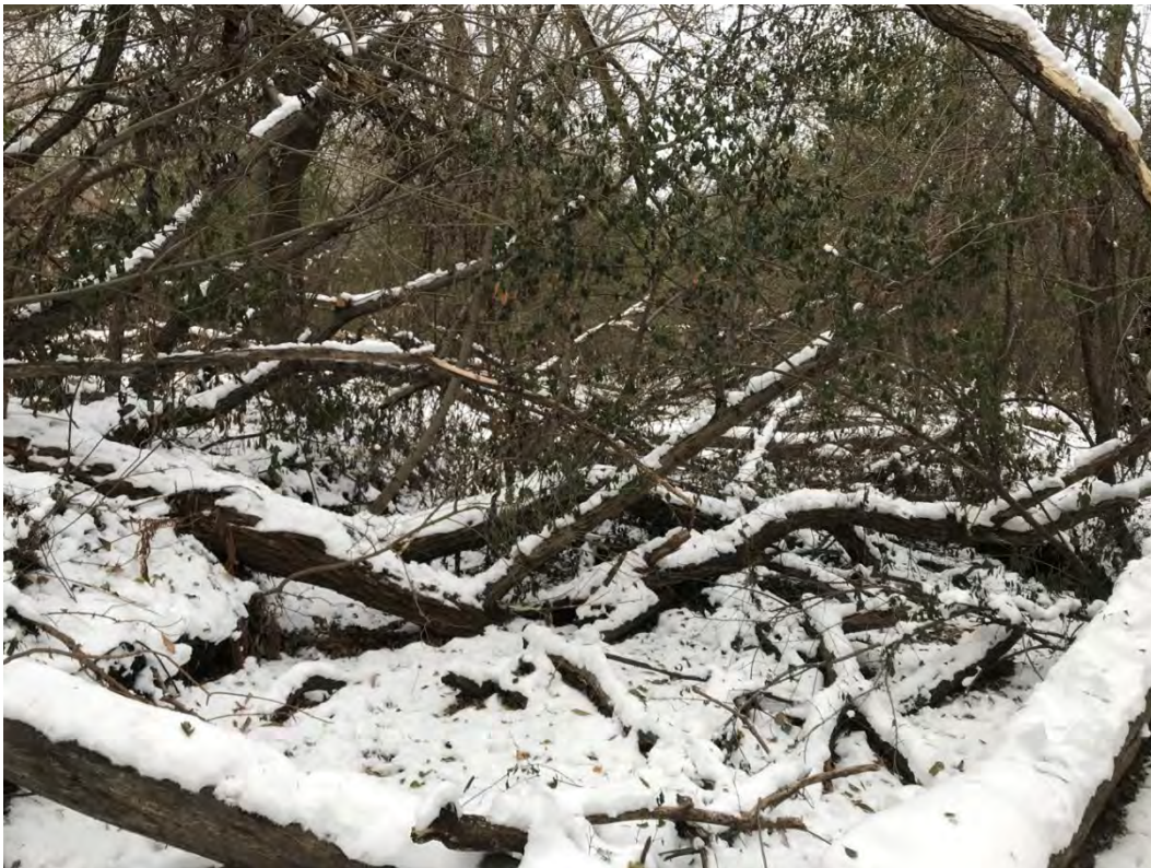
Figure A- 26 In-channel debris leading to bank erosion and sediment aggradation.