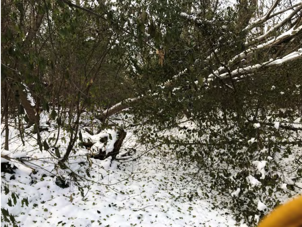
Figure A- 21 In-channel debris leading to bank erosion and sediment aggradation.