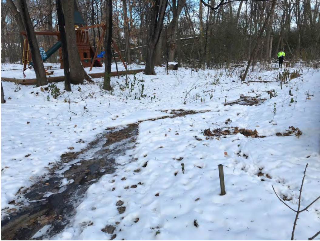
Figure A- 15 Southwest stormwater side-channel looking downstream.