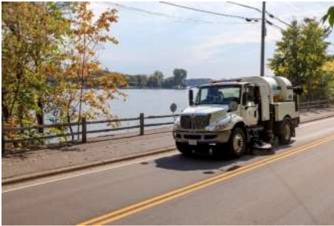
RAS Sweeper near Medicine Lake

City of Plymouth purchased a Tymco 500X Regenerative Air Street (RAS) sweeper to collect fine sediment and debris more effectively than mechanical sweeper. Financial assistance for purchase of the sweeper came from the Bassett Creek Watershed Management Commission, Elm Creek Watershed Management Commission, and Shingle Creek Watershed Management Commission. A requirement of the financial assistance includes annual reporting of use and effectiveness of the RAS sweeper.