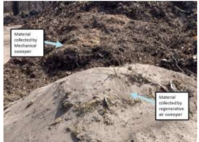
Example sweepings pile

The City's 2018 street sweeping policy assists in meeting the requirements of Municipal Separate Storm Sewer System (MS4) permit as a best management practice to reducing the amount of solids, nutrients, and chlorides entering water bodies throughout the City across all four watersheds.